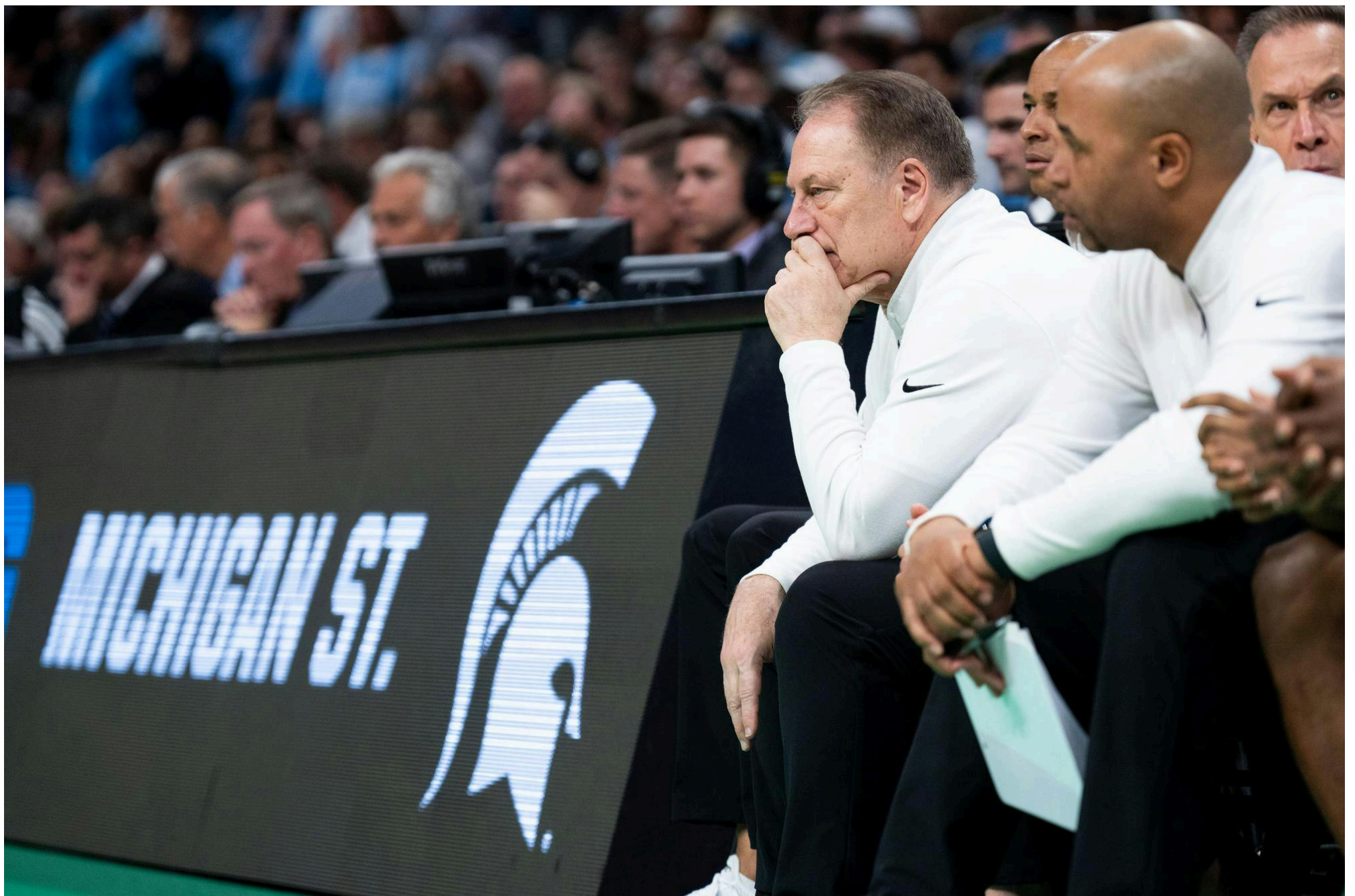
Michigan State head coach Tom Izzo watches his team play during round two of March Madness in Charlotte, North Carolina on March 23, 2024. The Spartans fell to the No. 1 seeded University of North Carolina and remain winless all-time against the Tar Heels during March Madness.